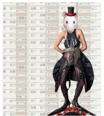
KOVID RAT KABARETT...