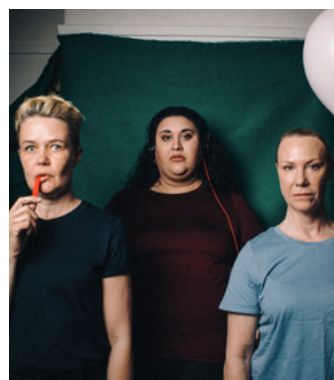
THE GRIEF TRILOGY