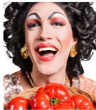
LA NONNA'S SAUCY SAUCE...