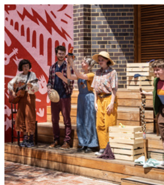
THE STORY KEEPERS