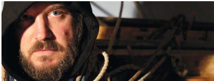
The Shrink and Swell of Knots

La Mama's EXPLORATIONS season has been supporting works in development since 1980. For many productions this is the beginning of a long and successful journey, with 2014 seeing Hello My Name Is... (Dublin Theatre Festival), Waking Up Dead (fortyfivedownstairs), Death By Soprano (Spiegel tent) and The Shrink and Swell of Knots (Brisbane Festival) all having the chance to impress the wider theatrical community.