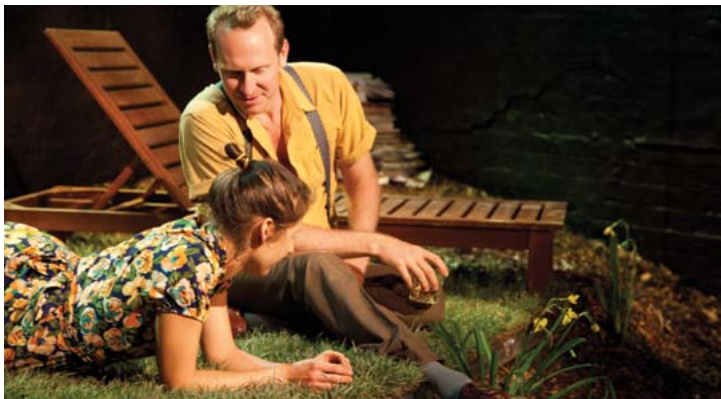
We Were Almost Entirely Happy

La Mama's list of Alumni reads like the Who's Who of Australian theatre including such greats as David Williamson, Cate Blanchett, Jack Hibberd, Graeme Blundell, Judith Lucy and Julia Zemiro. La Mama is proud to play a crucial role in fostering the distinguished careers of so many established and emerging Australian artists.